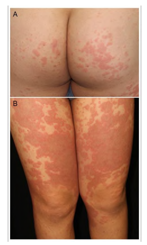
Figure 1. Clinical pictures of the skin lesions. (A) various-sized, small erythematous macules in the buttock; (B) irregularly shaped, well-demarcated, large erythematous plaques in the thighs.