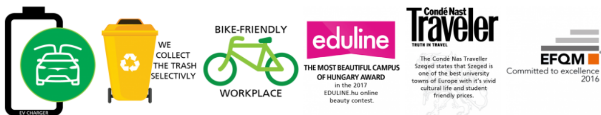
Figure 2. Various awards promoted on the Green Report page of the University of Szeged.

The University of Szeged does not have an easily accessible, single website dedicated exclusively to sustainability. It has some sub-pages where the concept of a green university appears, but they are not comprehensive at all and give some limited information only in Hungarian ( https://u-szeged.hu/zoldegyetem ; https://u-szeged.hu/kozponti-egysegek/zold-egyetem/zold-egyetem ; https://u-szeged.hu/tik/zoldintezmeny ). The highest priority is given to communicating the ranking positions of the university and the various awards it has received, although not all of them are related to sustainability (see Figure 2). One of these pages emphasizes the importance of continuous infrastructure development for green purposes and the formation of green attitudes among university citizens. Here, too, the visitor can read about two projects from the years 2016 and 2019. Under the Green Report one can find achievements related to Energy and Climate Change, Waste and Transportation from the year 2022, but without any further information. These pages have not been updated recently and do not contain current, detailed information.