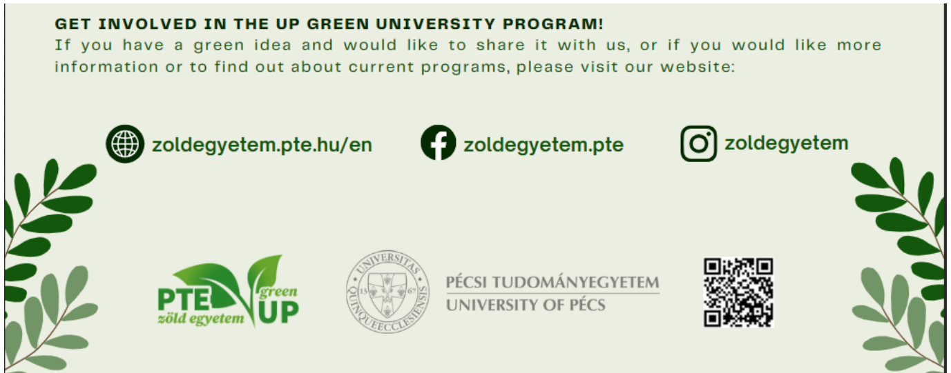
Figure 1. All social media sites linked to the green university concept of the University of Pécs.

Its main focus is to activate and involve students in creating new solutions and participating in sustainability projects. To achieve this goal, the website is appealing with lots of visuals, photos and videos showing student activities. The SDG areas prioritized on the website are Education and Research with the latest sustainability reports and media footages, Transportation, Waste management, and Energy and Climate Change. This is all in line with the university's rankings in these areas, with the exception of Water management.