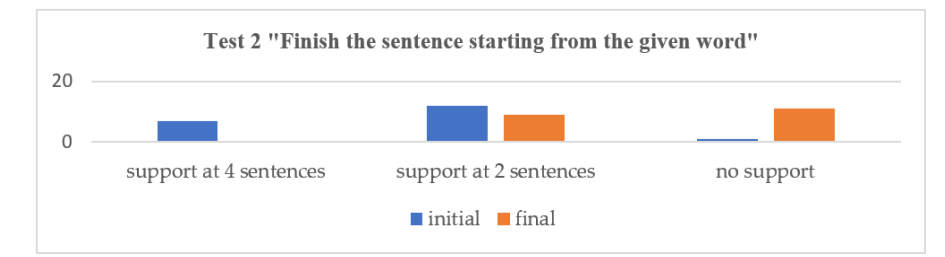
Figure 2. Graphical representation of the answers to Test 2—"Finish the sentence starting from the given word".

In the pre-test, 7 children out of 20 children require support for at most 4 sentences, 12 children out of 20 require support for at most 2 sentences and 1 child out of 20 children does not require support for all 5 sentences (Table 4). In post-test, no child out of 20 does not require support for at most 4 sentences, 9 children out of 20 require support for at most 2 sentences and 11 children out of 20 children do not require support for all 5 sentences. As it can be seen in Figure 2, the children had improved their cognitive ability at the end of the experiment.