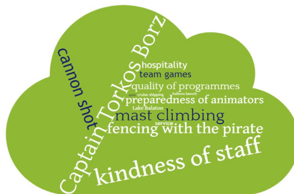
Figure 4. Word cloud of the most popular programme elements.

Those who completed the questionnaire were also able to make suggestions for further improvements. Those who responded overwhelmingly used various phrases such as “it was perfect”, but many missed the buffet, especially the coffee facilities, which should be changed in the future.