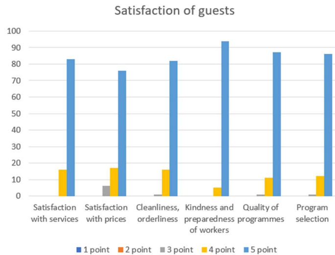
Figure 3. Guest satisfaction.

swordfight with pirates, the high quality of service and the quality of the team games, as shown in the word cloud in Figure 4 .