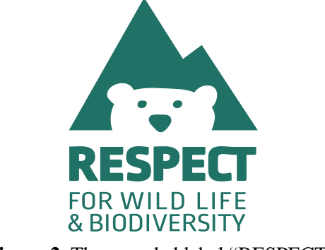
Figure 2. The awarded label "RESPECT".

To guarantee the legal safeguarding of the "RESPECT" label, its design was officially registered as a trademark with the appropriate regulatory authorities. This process included an in-depth evaluation to verify the originality of the design and its consistency with the label's core mission and values (De Vries et al., 2017; Kerly, 2020). By obtaining trademark protection in international level, the Eco-label's exclusive use was ensured, preventing unauthorized reproduction and reinforcing its distinctiveness in the marketplace (Block et al., 2014; Kerly, 2020). This step was crucial in maintaining the integrity and credibility of the label, allowing it to be recognized as a trusted symbol of sustainability and biodiversity conservation (Bently and Sherman, 2014; de Almeida and Trzaskowski, 2018).