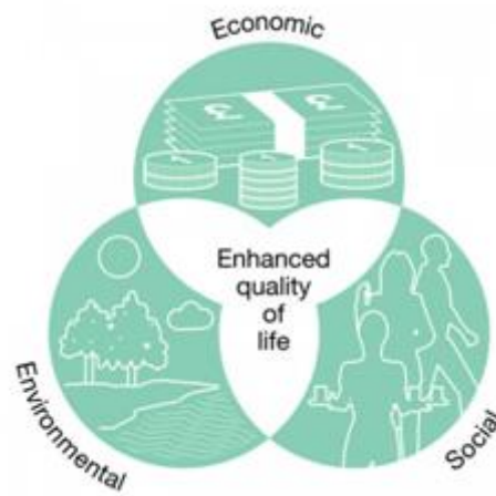
Figure 2. The TBL model (as adapted from Chamberlain, 2023).

One of the primary frameworks utilized by organizations to evaluate the economic benefits resulting from their corporate sustainability initiatives is the TBL (Brusseau, 2019; Chamberlain, 2023). The TBL approach challenges people to look beyond the conventional bottom line of organization and consider the financial, social, and environmental gains the organization achieves. One of the greatest ways to gauge how successful and sustainable the organization is to measure it using the TBL (Chamberlain, 2023).