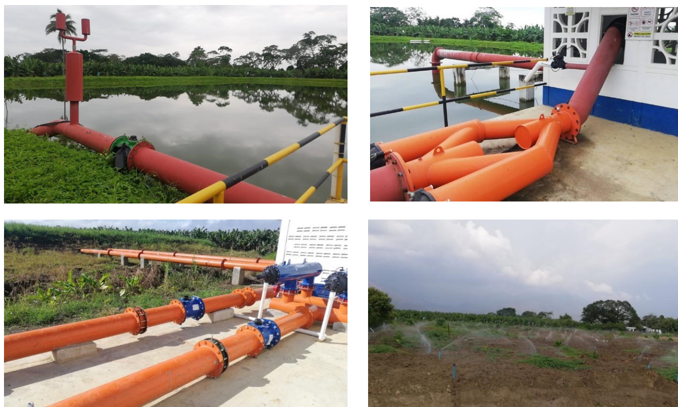
Figure 1. Sprinkler irrigation system implemented in the banana plantation.

selected system. A surface irrigation system was ruled out due to the farm's lack of slopes. The micro-sprinkler system was considered too expensive due to the extensive equipment required for the farm's size, and drip irrigation was deemed unsuitable for banana crops because of the need for overhead, non-buried pipes.