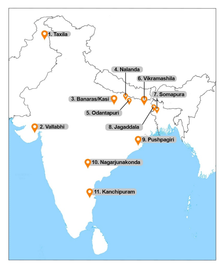
Figure 1. Major ancient higher education institutions.