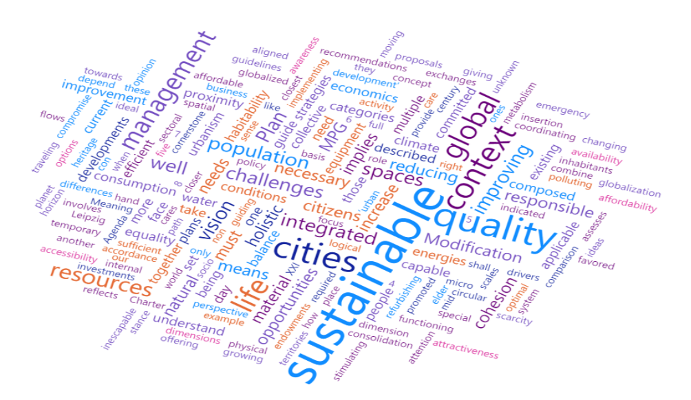
Figure 3. Word panel analysis.