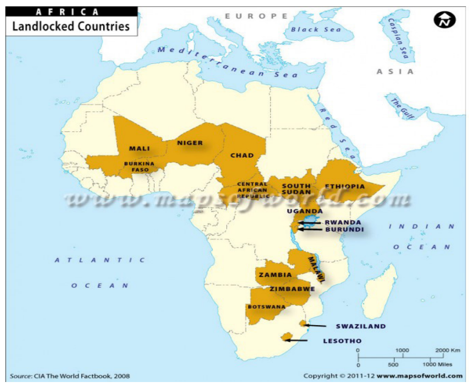
Figure 1. Landlocked countries in Africa

the costs of being landlocked, as well as its economic ramifications, from the development aspect (UN-OHRLLS, 2019; Arvis et al., 2007). Geographic isolation, lack of direct access to the open sea, and high transportation and transit costs put landlocked countries at a significant economic disadvantage compared with the rest of the world. A country that is landlocked is more likely to be impoverished. Most countries without access to the coast are among the poorest in the world, and their citizens are among the poorest billion of the population (Goldberg, 2017). Because landlocked countries rely on the markets, infrastructures, and institutions of their transit neighbors to get their commodities to port, these countries have lower per capita incomes and are categorized as least developed (UN-OHRLLS, 2014).