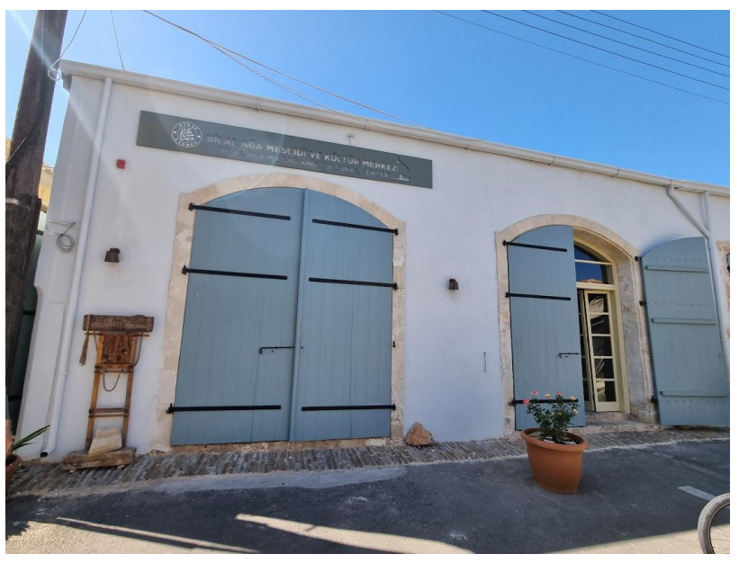
Figure 9. Bilal Aga Masjid and Cultural Center.

Another significant point of interest on the Closed Varosha Dark Tourism tour is the Bilal Aga Masjid and Cultural Centre. It is documented that the mosque was inaugurated for worship on 20 July 2021, following a period of 47 years ( Figure 9 ). The panel situated at the front of the mosque presents an account of the site's history ( Figure 10 ). The total area of the mosque (dated 1813) and adjacent lands belonging to the Bilal Aga Foundation is 582.6 m². According to the archive of the foundation, dated 8 November 1902, the foundation is located to the west of the mosque and was constructed from cut stones in 1891.