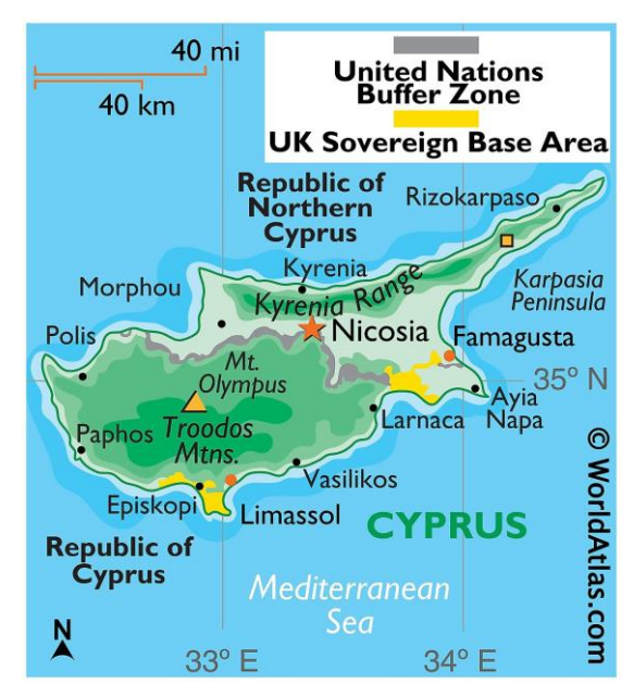
Figure 1. Map of Cyprus showing the "United Nations" buffer zone and UK military bases.

The area, which was inspected by the United Nations (UN) and located within the "Green Line" that demarcates the separation of Cyprus into two distinct parts, was subsequently closed to settlement and habitation in accordance with the resolutions issued by the United Nations Security Council (UNSC). Following 46 years of closure, the enclosed Varosha area was partially opened to the public at the unilateral discretion of the TRNC, amidst a geopolitical climate in the Eastern Mediterranean that is undergoing significant shifts (Erçakıca and Yüksel, 2023; Kahya, 2022; Kırmızıgül, 2021). Figure 1 illustrates a map of Cyprus, delineating the UN buffer zone and the locations of UK military bases.