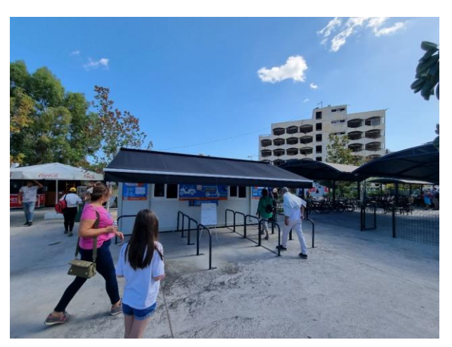
Figure 3. Entrance of Closed Varosha.

The Ghost Town of Varosha, where time stopped in 1974, Varosha, known as the "Las Vegas of the Mediterranean", gives its visitors the feeling of travelling back in time. The 5-star hotels, famous brand shops, restaurants, houses, parks, beaches and 50-year-old landscape structure without human intervention attracts visitors by making them imagine all the details of how the area looks deserted and uninhabited after a deep sleep. Passengers who get off in the parking area reserved for organized tours can enter the 1.5 km long Closed Varosha tour route from the checkpoint. There are also possibilities for public transport and private cars to reach Closed Varosha. After entering Closed Varosha, the bicycle and scooter rental area, the ticket office, the resting and sitting area, the buffet and the asphalt road prepared for visits appear as arrangements made for dark tourism visitors ( Figures 3 and 4 ).