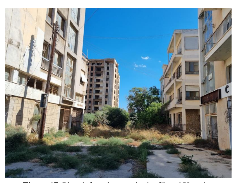
Figure 17. Plant infested streets in the Closed Varosha.