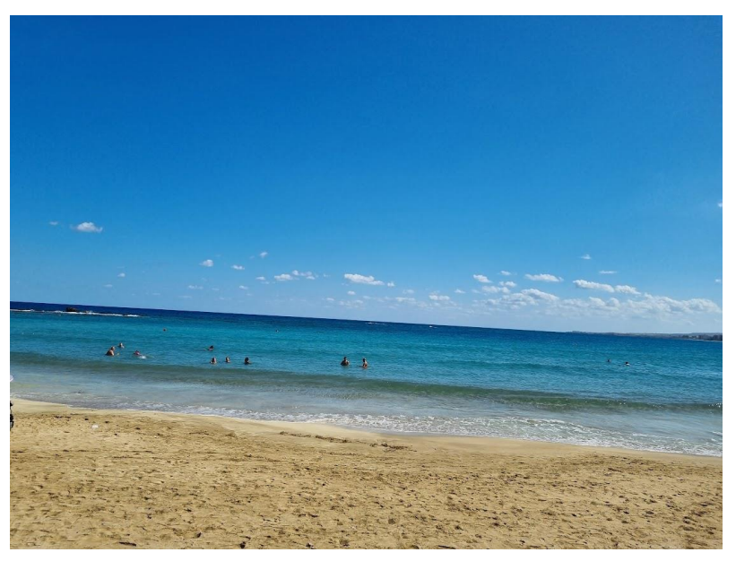
Figure 12. The Closed Varosha beach.

of visitors, a variety of facilities have been constructed, including toilets, showers, changing cabins, and other amenities ( Figure 13 ). Those visiting the beaches in Closed Varosha today have the option of dining at a restaurant in the area following their swimming and sunbathing activities on the distinctive beach, which features fine white sands. The significance of this ghost town, situated on the coastline, can be more fully appreciated by a direct observation of the area. While the lack of utilization of the 8 km coastline and the sea-sun-sand tourism potential of the closed Varosha for approximately 50 years is perceived as a loss for humanity, the prolonged period of inactivity has had a beneficial impact on the preservation of the natural landscape structure of the area. It is evident that the region should be revitalized for sustainable use scenarios in the future, without being exposed to human use pressure.