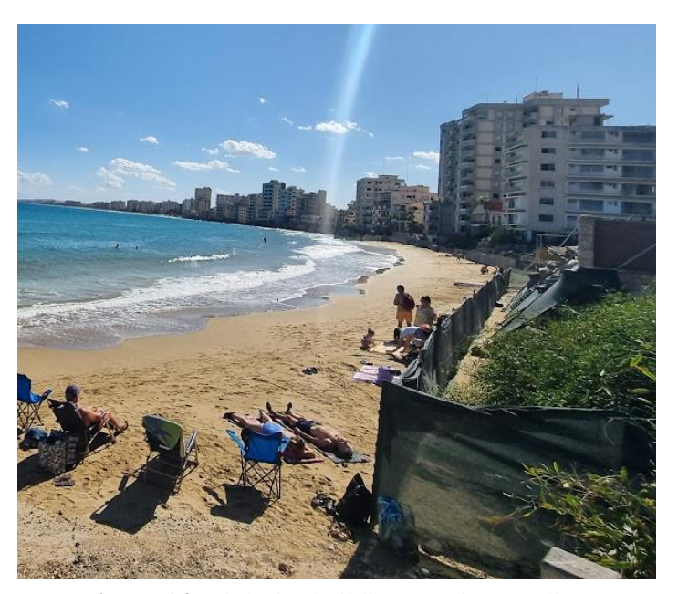
Figure 14. High-rise buildings on the coastline.

It is permitted for tourists to engage in swimming activities in the sea at Palm Beach during the organized tours to the Closed Varosha. Additionally, the public beach at Palm Beach and the derelict high-rise luxury hotels from the period along the coastal strip can be observed from the sea ( Figure 14 ). In the closed beach area of Varosha in 1974, there is a proliferation of modern high-rise hotels. From 1960 to 2016, numerous hotels were reportedly fully booked by prominent figures in the Hollywood film industry. Figure 15 illustrates a hotel building where the entrance is obscured by dense vegetation and the lower part is repurposed as a café.