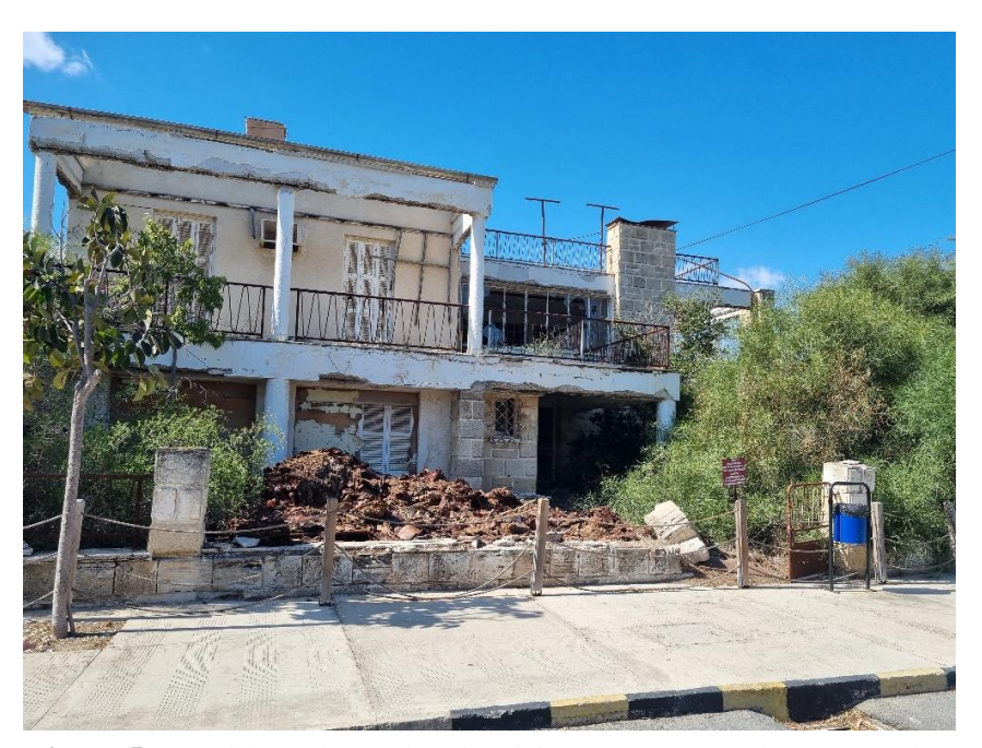
Figure 5. A residence located at the visitor entrance to Closed Varosha.

It can be seen that all the participants in the dark tourism tour are in a hurry to leave the areas organized for today's tourist visits as soon as possible and to see the traces of how the buildings and the landscape have been preserved or changed after the trauma experienced. This is because the visitors start to examine the surroundings of the buildings right next to the entrance, looking for traces of 1974 by examining the trees in the gardens that have not been pruned for 50 years and the buildings that have not been renovated and maintained ( Figure 5 ).