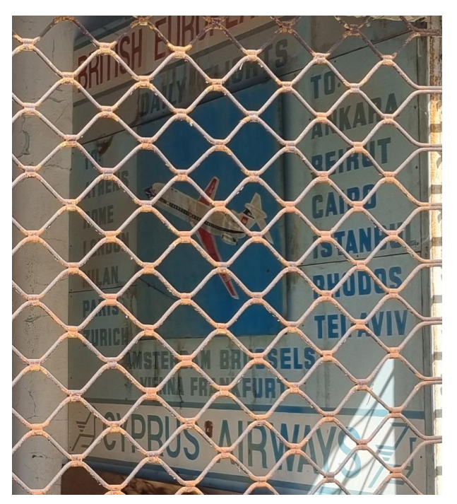
Figure 11. Flights to Varosha city in 1974.

In 1974, an airline company initiated a programme of scheduled flights to a number of international destinations, including Ankara, Beirut, Cairo, Istanbul, Rhodes, Tel Aviv, Rome, London, Paris, Milan, and Athens ( Figure 11 ). The existence of flights to Cyprus in 1974, a destination of global importance, indicates that Varosha constituted a significant tourist destination during that era.