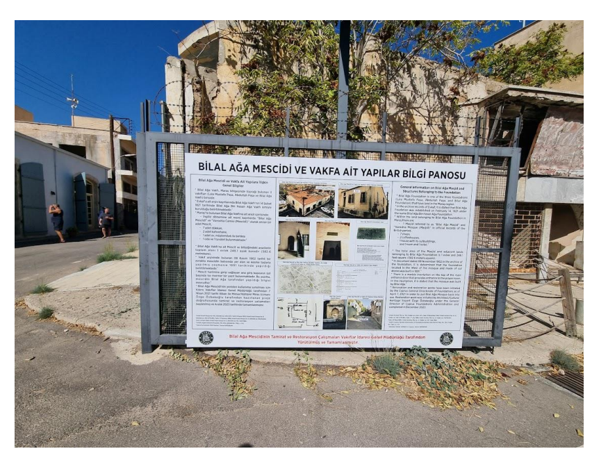
Figure 10. General information on Bilal Aga Masjid.