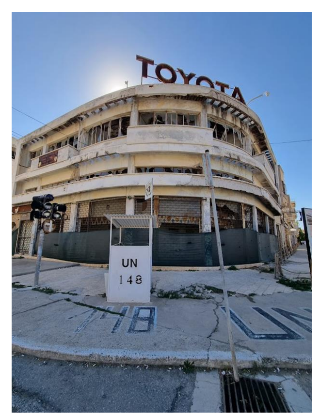
Figure 7. The most visited point (Toyota building) in Closed Varosha.