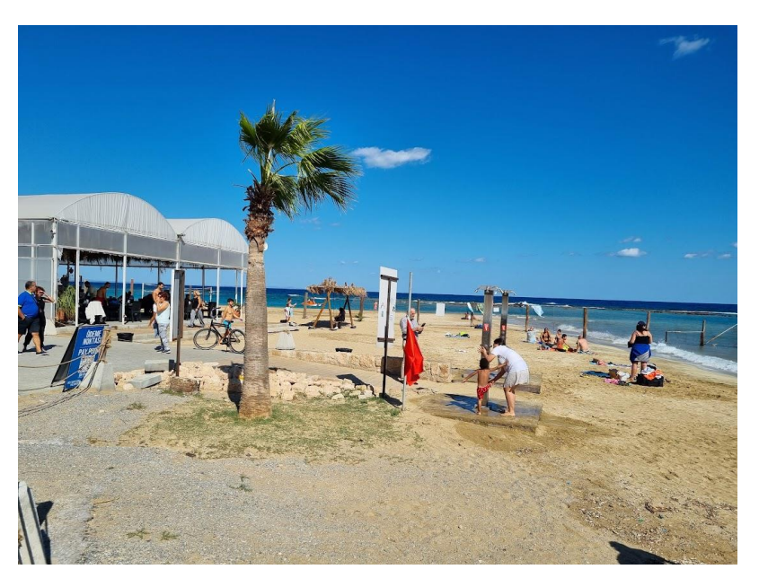
Figure 13. Regulated areas in the beach of the Closed Varosha.