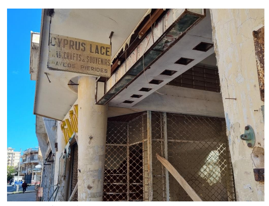
Figure 6. A souvenir shop in the Closed Varosha.