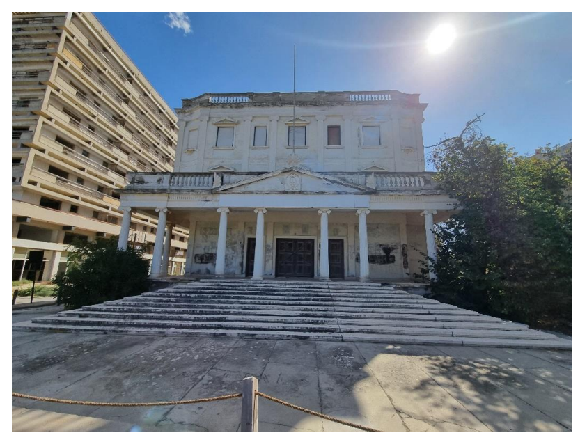
Figure 16. Art school opera house in the Closed Varosha.

One of the most significant points of interest on the Closed Varosha tour is the opera house, which was previously an art school and is depicted in Figure 16 . It is one of the 14 theatre buildings that existed in Varosha in 1974 and is regarded as a prominent landmark associated with opera. Its historical significance and architectural grandeur evoke a sense of longing among visitors to experience the sounds of music emanating from the opera house once more. Although the Closed Varosha visit appears to be a city when viewed from a distance, it is evident that the areas have not been visited for years since they were abandoned have been overtaken by nature. Invasive plant species have proliferated, and the areas have reverted to a state of nature. As illustrated in Figure 17 , structures situated in remote locations, devoid of human intervention, can serve as potential habitats for diverse biological communities.