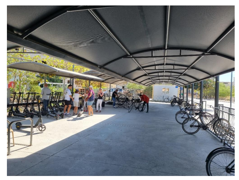
Figure 4. Bicycle rental area at the entrance of Closed Varosha.