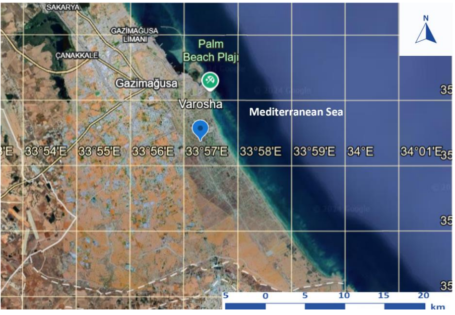
Figure 2. Map of Varosha.

The total area of Varosha is 6.4 km², and there is an 8 km long coastline known for its white sand ( Figure 2 ). As reported by Dağlı (2015) "Varosha has developed as one of the most famous entertainment and tourism centres in the world, especially after Beirut, the city of trade, entertainment and tourism, lost its importance due to the war in Lebanon in 1969–1970 (Dağlı and Önal, 2001). With its holiday resorts and highrise 5-star hotels, the town developed and became an example of the 'year-round holiday' principle of the period [56]. During this period, Varosha had 45 hotels and 60 apartment hotels with a capacity of 10,000 beds, about 3000 commercial buildings, 99 entertainment buildings (cabaret, bar, restaurant, cafe and tavern, etc.), 25 cultural buildings (theatre hall/cinema, state library with 8500 books and art gallery, etc.), 143 administrative offices, 4649 apartments, 21 bank branches, 380 buildings under construction and industrial buildings (Dağlı, 1999)".