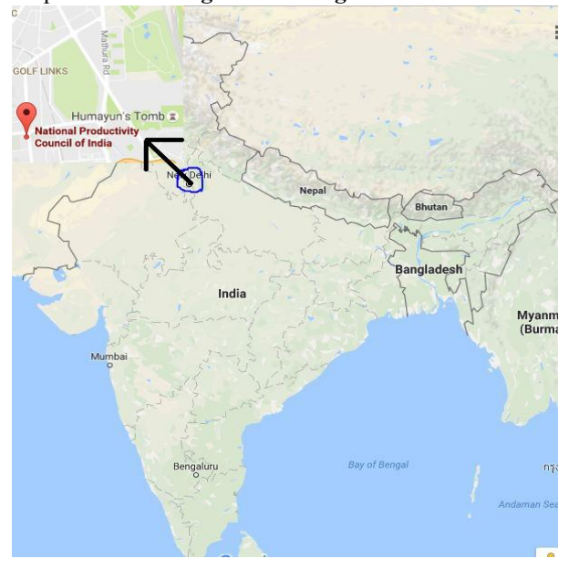
Figure 3; Study location imposed on map of India.

The power generation data is captured through online monitoring of the system. On the day 1 of the experiment, the panels were cleaned thoroughly using clean cloth, water and again with cloth to remove the dry dust, wet dust and bird dropping. Without cleaning the panels for next 15 days, daily hourly power generation data was capture daily, and cumulated for 5 days each. On the 16th day, panels were again clean to remove the dry dust settled on the panel due to high level of pollution around the site location. From the 16th day after removal of dry dust from panel and power generation data was captured on daily basis and again cumulated for 5 days. The site location and experiment setup is shown in Figure 3 and Figure 4 .