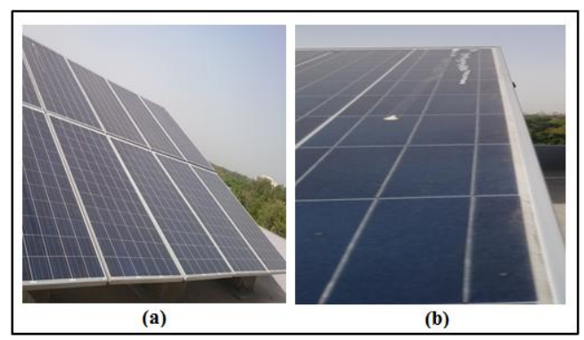
Figure 2 ; Installation of Solar panels (a) with dust and (b) with bird dropping.

Based on the above situation (as depicted in Figure 2 ), real data has been collected from installation site in the month of April' 2016. The purpose of such collection is to estimate the loss in power generation by developing a simple and reliable theoretical analytical model. To build such analytical model, several steps have been considered which includes installation of 300 Wp Titan solar panels, with tilt angel of 28 degree and REFUsol 010K (1), REFUsol 020K+ (1) type invert system. Furthermore, to investigate the loss in power generation, the power generation data and solar radiation data has been collected for 20 days such that: