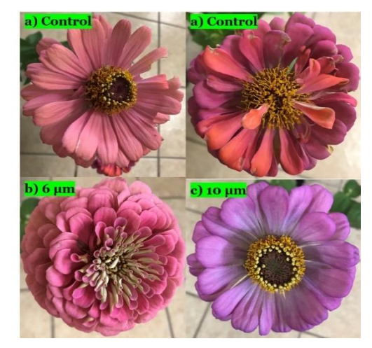
Figure 5. Characteristics of Zinnia flowers during postharvest treated with vanadium; (a) control; (b) 6 \mu m ; (c) 10 \mu m .