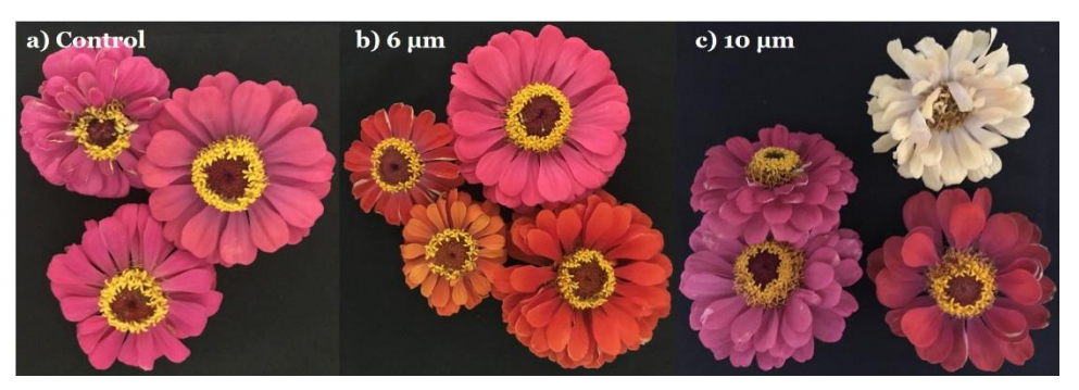
Figure 4. Characteristics of Zinnia flowers treated with vanadium during harvest; (a) control; (b) 6 \mu m ; (c) 10 \mu m .