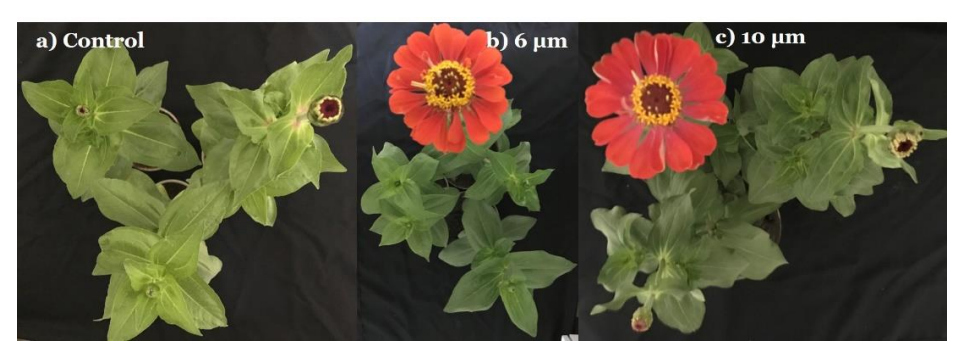
Figure 3. Effect of vanadium during the development and appearance of flowers in Zinnia ; (a) control; (b) 6 \mu m ; (c) 10 \mu m .