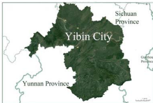
Figure 2. Map of Yibin City.

Yibin City is situated on the southern border of Sichuan, at the intersection of Sichuan, Yunnan, and Guizhou provinces (Figure 2). It is an excellent tourism city, and one of the top ten bamboo resource-rich areas in China, which has great potential for the developing bamboo industry. Although bamboo ecotourism began early, it evolved unevenly, and the bamboo sector is still in its early stage of development. It is useful to summarize the development dilemma of bamboo all-for-one tourism, by using Yibin as an example.