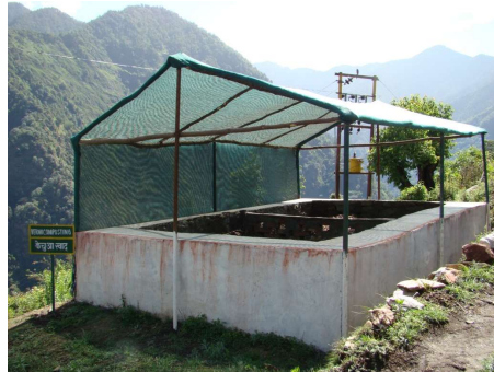
Figure 1. Vermi-composting rural technology in the region which replenishes soil fertility.

contributed equally for rural livelihoods promotion by effectively engaging with rural women groups [16]. Livelihood opportunities ( Figure 3 ) may also be accessed with the State Government departments like promotion of local product, preparation of handicraft items, promotion of local food items, exploring the potential of ecotourism in adjacent areas, etc.