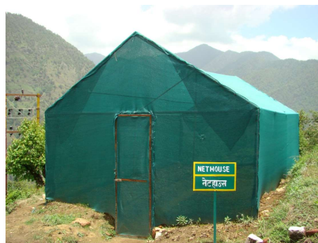
Figure 2. Shadenet house in the area which protects crops from harmful ultraviolet.