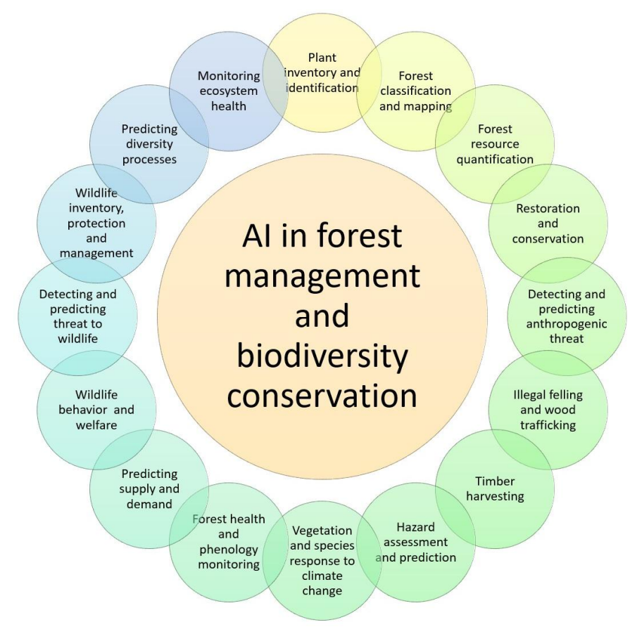
Figure 1. Overview of AI in forest management and biodiversity conservation.

The forest industry would greatly profit from technology's natural capacity to facilitate and embrace innovation across different regions and scales, and at a considerably accelerated rate. Hence, the objective of this review article is to offer an in-depth overview of the implementation of artificial intelligence in the forest industry and the preservation of biodiversity. Furthermore, this review study examines the difficulties encountered in the forest industry, the preservation of biodiversity, and the applicability of advanced AI technology in addressing these concerns. The findings of this study would inspire forest officials, scientists, researchers, and conservationists to investigate the potential of AI technology for the purposes of forest management and biodiversity conservation.