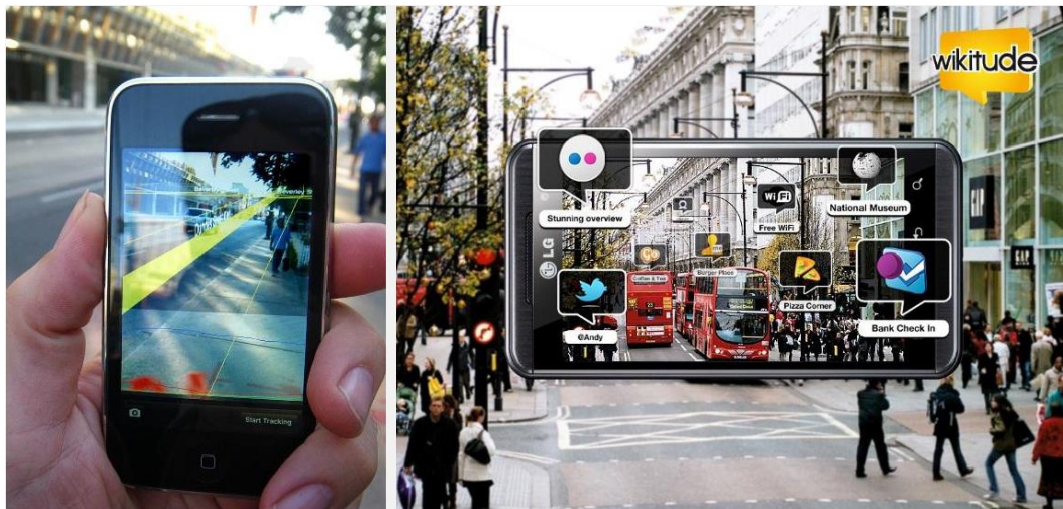
Figure 2. Examples of augmented reality and geolocated data. On the left image of a cell phone capturing a panoramic view of the street using a camera and superimposing the digital street map. On the right image of a cell phone capturing the panorama and displaying places, landmarks and objects in 3D.