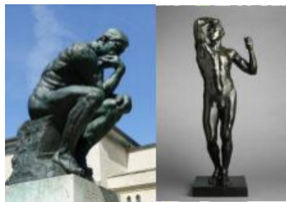
Figure 3: The Thinker Fig. 4: The Bronze Age

Sculptors, including all artists, should draw inspiration from nature and create truly vibrant works by observing the gestures, dynamics, and emotions of life. Mr. Rodin’s works turn static sculptures into works of art expressing emotion and vitality. It is full of vitality, dynamic, and very impressionism gives the flow of light on the surface of the sculpture, making us feel the flow of life contained in the sculpture. He reflects this realism in the deep emotion of his work and in his observations of human nature. We can feel his understanding of the truth and tenacity of human nature. Characters often face inner struggles and external pressures. They are no longer the same as the dull static traditional sculpture, more than fresh life, full of clever and jump sense. As if the next second will break through the shackles of the mud, the real appearance in front of us. For example, his work “The Thinker”, which naturally has clear and obvious muscle lines, strength and anger. The characters seem dull, but the eyes reveal a kind of firm and unyielding strength. This kind of rebellious true feeling comes from the deep understanding of the suffering of life, and the indomitable awe of natural life.