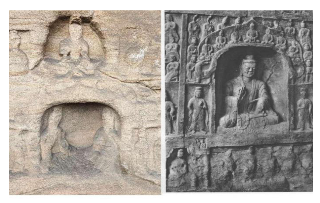
Figure 1 Cave 5 of Wuguantun Grottoes (left) and the lower layer of the west wall of Cave 26 of Yungang Grottoes (right)

In addition, most of the grottoes in Wuguantun are dominated by statues of intersecting feet Bodhisattva and two Buddhas sitting together, with flanks carved on both sides. They are also popular into the main Buddha statues in the second phase of Yungang Grottoes, and more in the third phase of the grottoes, so the statue theme of Wuguantun Grottoes is produced in line with the trend of the second phase of Yungang Grottoes.