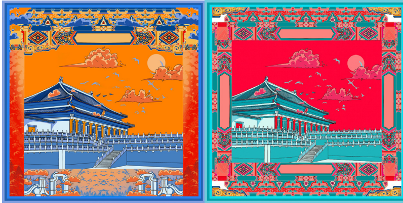
Figure 4-3 Finished Product