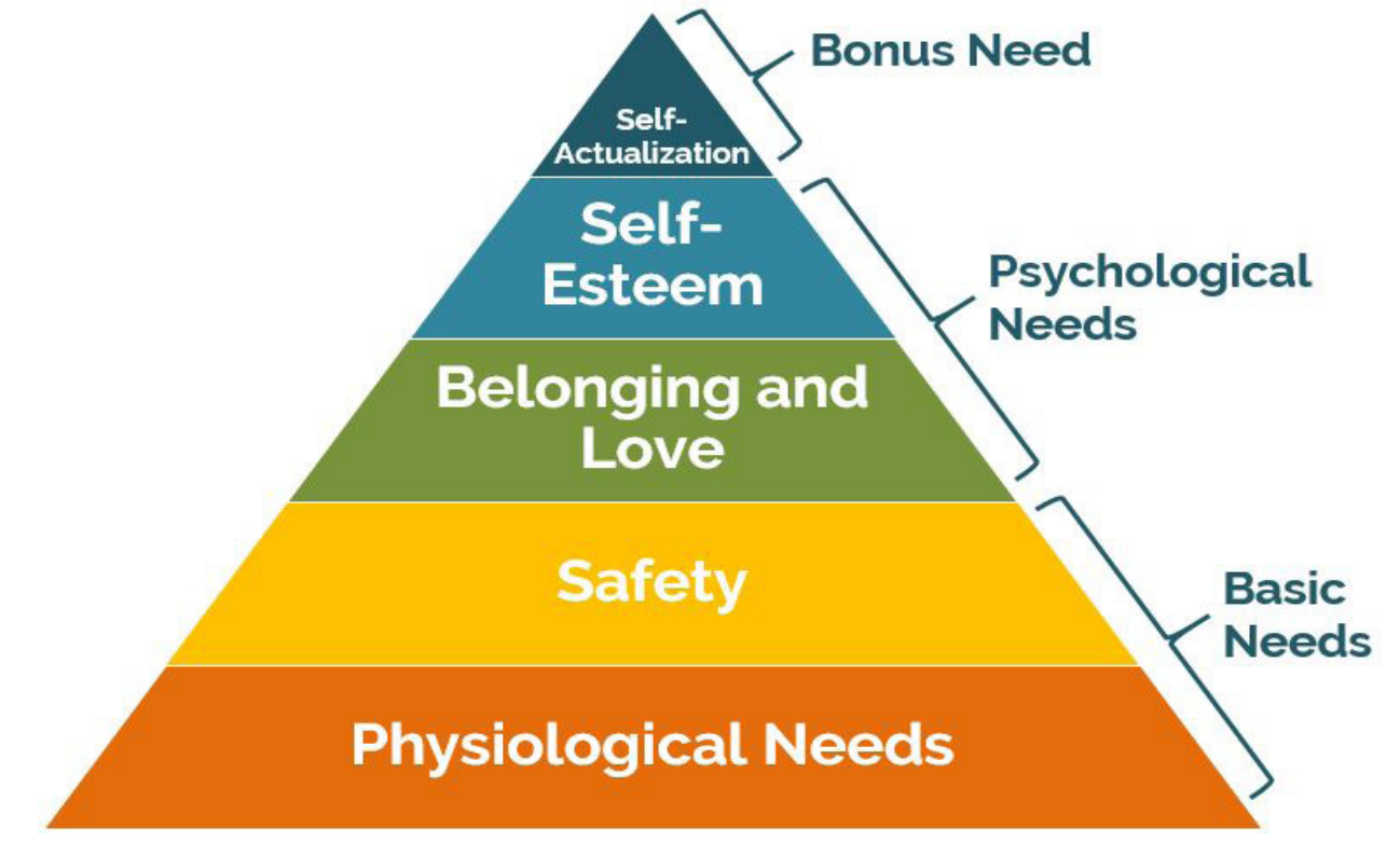
Figure 1. Maslow's hierarchy of needs model (Hester, 2017)

Abraham Maslow's hierarchy of needs is one of the most popular theories of motivation. The theory posits that people are motivated to fulfill five primary needs: physiological, safety, love and belonging, esteem, and self-actualization (Gawel, 1996; Hopper, 2020; Maslow, 1943; McLeod, 2007; Navy, 2020). According to Maslow's hierarchy of needs, people must first meet their physiological needs (such as food, water, and shelter) before other needs. Once these physiological needs are met, people move up the hierarchy, focusing on safety needs (including security and protection), love and belonging needs (including friendship, intimacy, and social status), esteem needs (including self-respect and recognition from others), and finally self-actualization needs